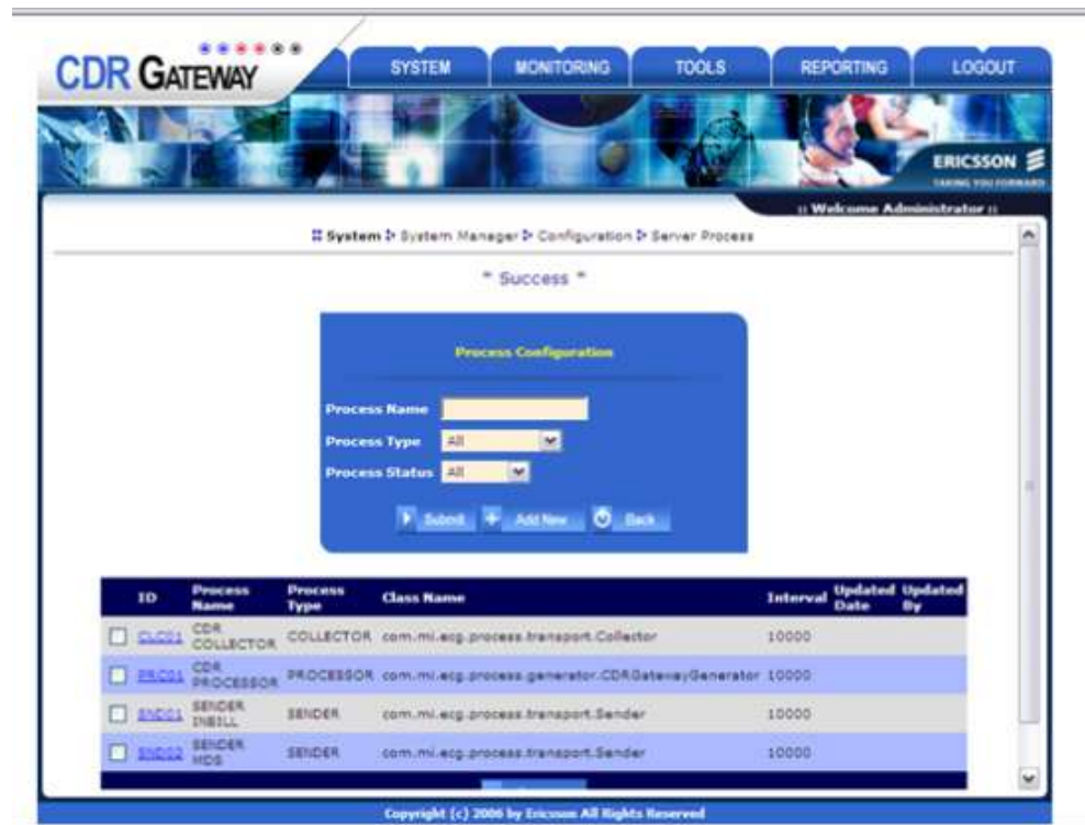
Screenshot of CDR Gateway